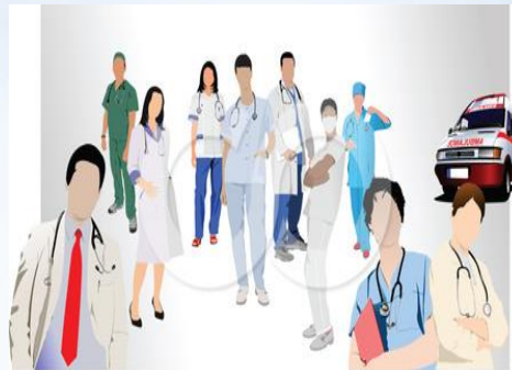
Staff (all types)