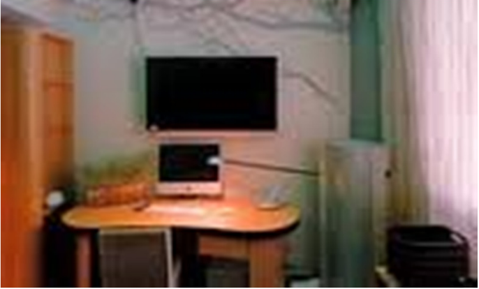
Natural design in the single room