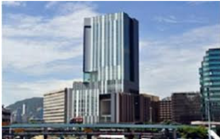
ICON Hotel (HKPolyU)