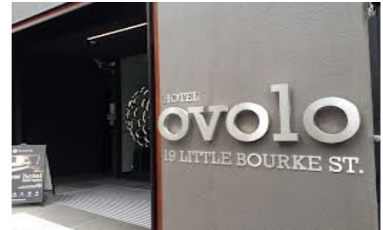
Ovolo Hotels, HK & Melbourne