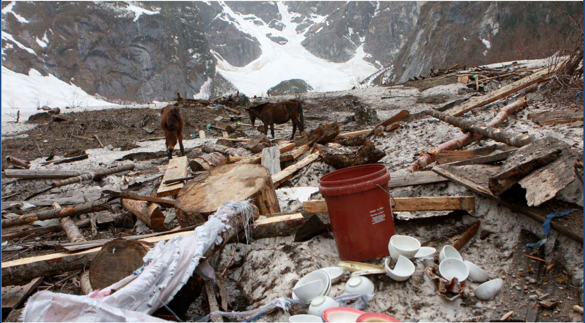
Yubeng, Yunnan 摄于云南雨崩