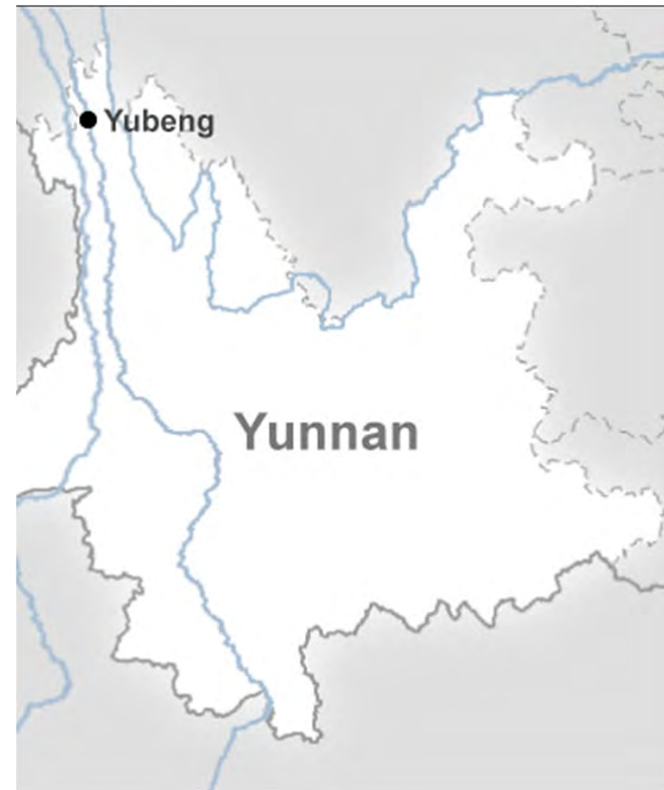
Yubeng, Yunnan