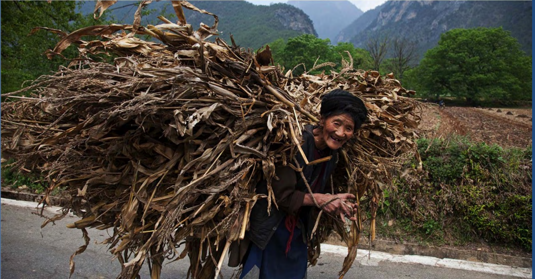
Yunnan