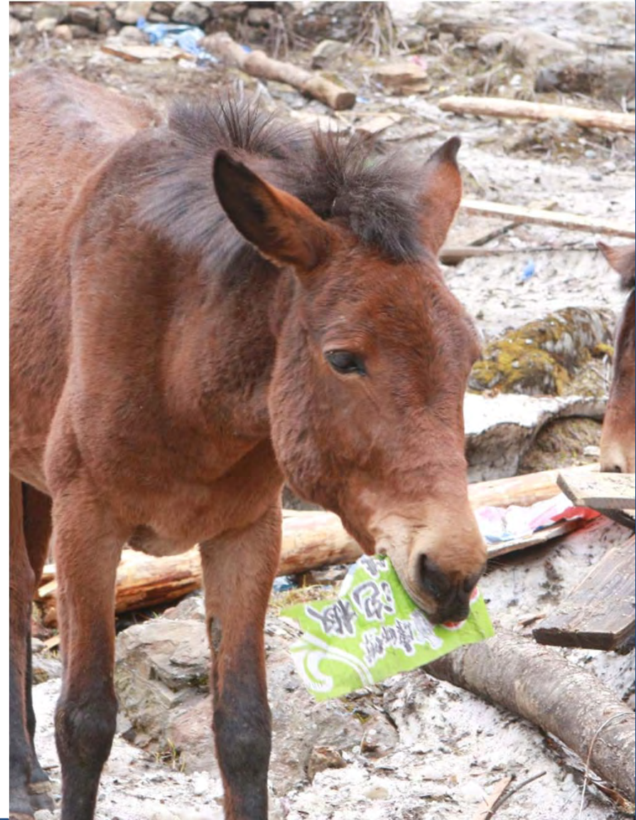
Yubeng, Yunnan 摄于云南雨崩