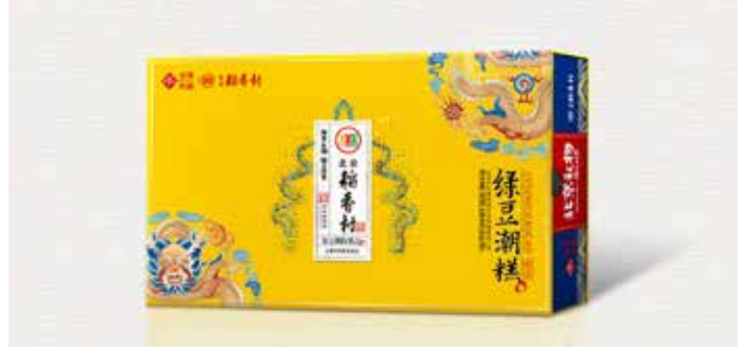
Daoxiangcun Bakery – Mung Bean Cake