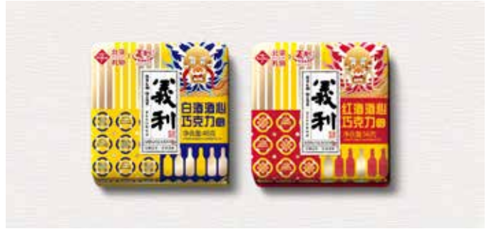
Yili – Liqueur-filled Chocolates