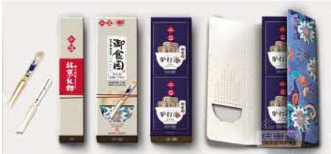
Yushiwan – Glutinous Rice Rolls with Sweet Bean Flour