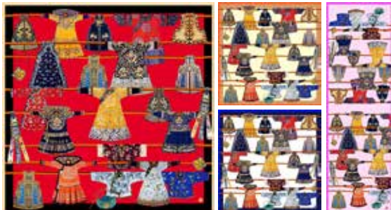
Imperial Clothing Collection