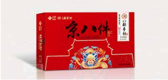
Daoxiangcun Bakery – Eight Beijing Style Pastry