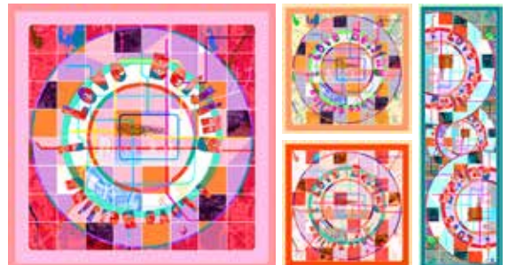
Loving Beijing Collection