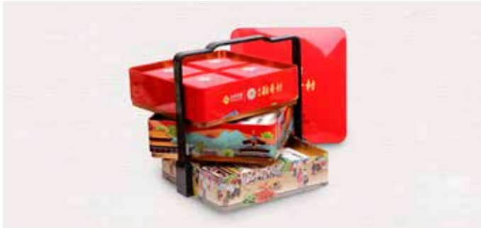
Daoxiangcun Bakery – Cantonese-style Mooncake