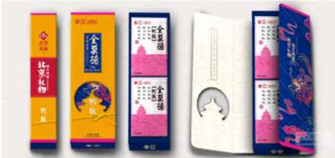
Quanjude – Duck Gizzard