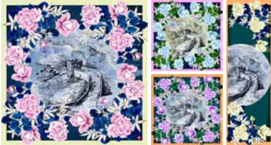
Beijing's City Flower Collection