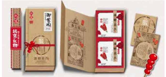
Yushiwan – Candied Haw