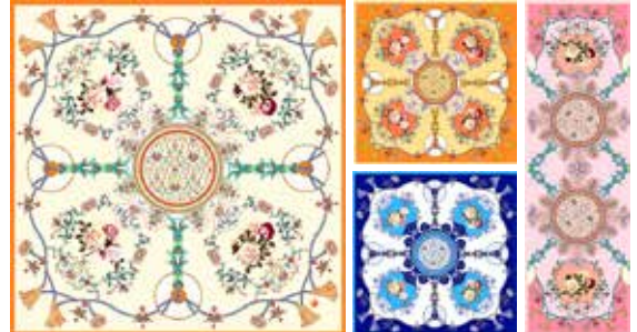
Chinese Knotting Collection